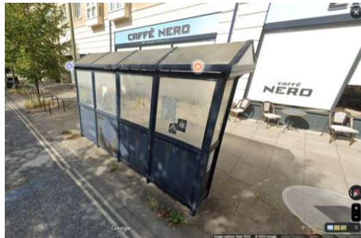
Marriott's Bus Shelter

The ownership of the redundant bus shelter at Marriott's Walk has been disputed for a number of years and is now beyond repair.