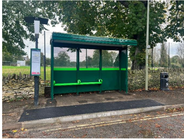
Staple Hall stop (for information)

OCC have suggested the shelter should be the same style as installed at Staple Hall, but with ends since there is ample footway width and solid upper panels since it will be located against the wall. The replacement bus stop pole and flag will be the OCC Premium specification, like the other stops in the centre of Witney.